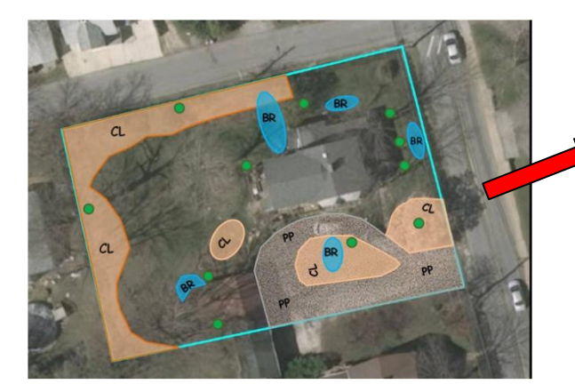
Figure 2: Aerial Photo of the Old House Example and Tom's UNM Pledge.

Tom has an old house on a half acre lot in Bay County. He wants to make a difference in the Bay, so he contacts Joe at Bay County who conducts an on-site visit to assess homeowner BMP potential on his property. Based on the assessment, Tom builds five rain gardens that treat all of his rooftop runoff, installs a permeable driveway, and signs a pledge to follow the core urban nutrient management practices on his lawn (see Figure 2).