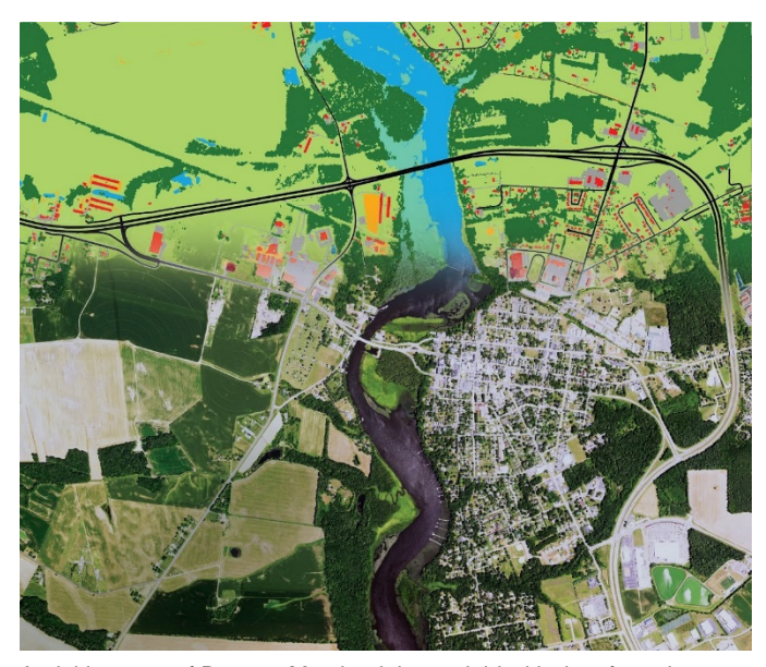
Aerial imagery of Denton, Maryland, is overlaid with data from the Chesapeake Bay High Resolution Land Cover Project. The data, newly included in the Watershed Model, delivers 900 times more information than existing data, showing land cover such as tree canopy (represented in dark green), buildings (represented in red) and roads (represented in black).

The Phase 6 Suite of Modeling Tools can also simulate the environmental impacts of population growth, climate change and sediment build-up behind the Conowingo Dam (on the Susquehanna River in Maryland), which helps decision makers explore options for addressing these factors.