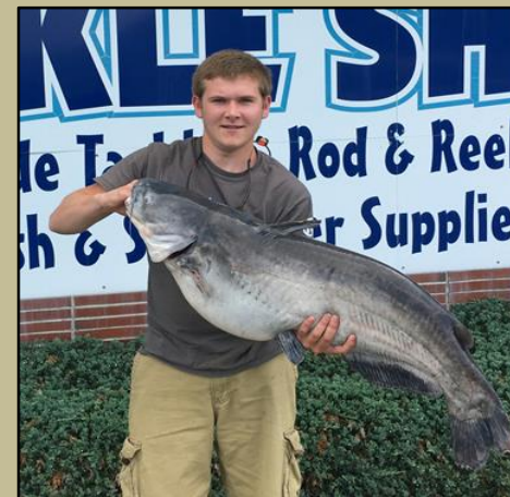
State Record 36lbs 3.2oz, upper Nanticoke River, Seaford, DE