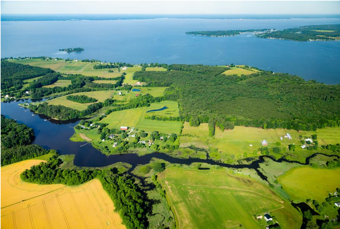
The Wicomico River, top, and Whites Neck Creek, bottom, flow toward the Potomac River in Charles County, Md., on June 5, 2018.