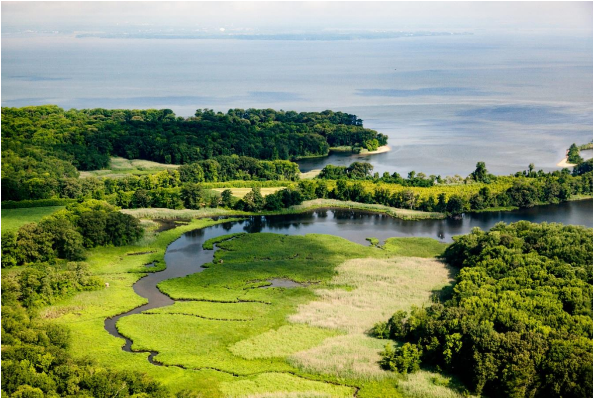
Wetlands flow into the Chesapeake Bay near the mouth of the Elk River in Cecil County, Md., on June 27, 2016.