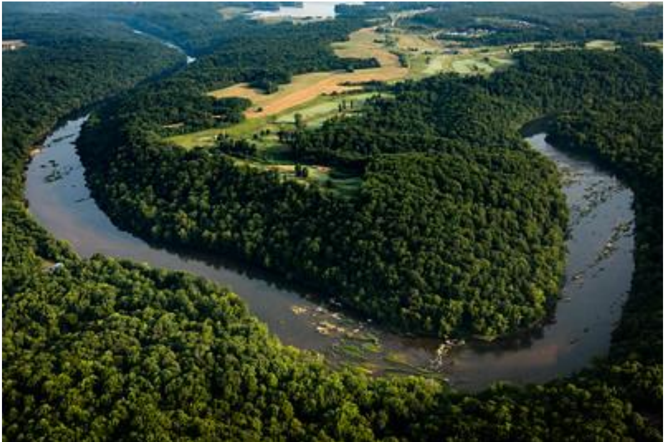
Rappahannock river in Spotsylvania county, VA