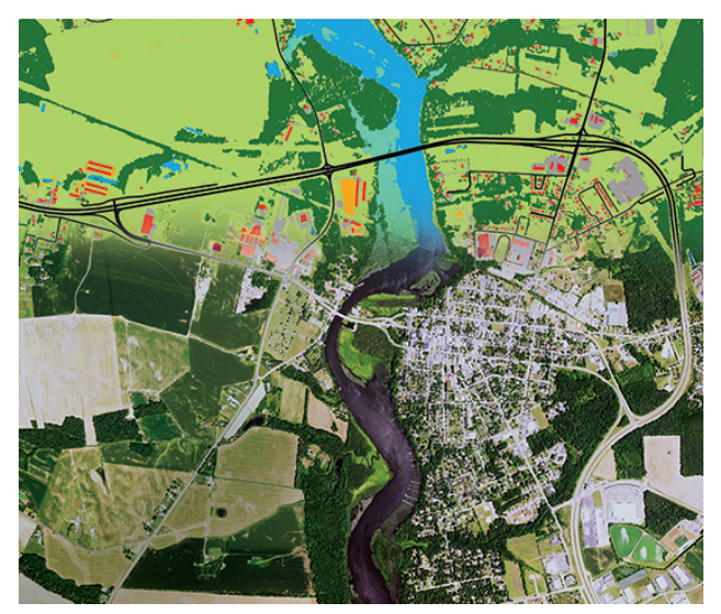
Aerial imagery of Denton, Maryland, is overlaid with data from the Chespeake Bay High Resolution Land Cover Project. The data, newly included in the Watershed Model, delivers 900 times more information than existing data, showing land cover such as tree canopy (represented in dark green), buildings (represented in red) and roads (represented in black).

The Phase 6 Suite of Modeling Tools can also simulate the environmental impacts of population growth, climate change and sediment build-up behind the Conowingo Dam (on the Susquehanna River in Maryland), which helps decision makers explore options for addressing these factors.