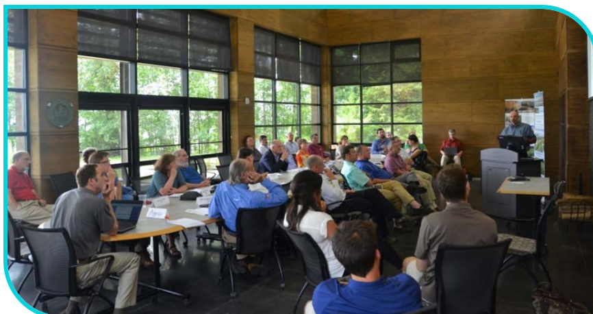
June 2016 Full Fisheries GIT Meeting.