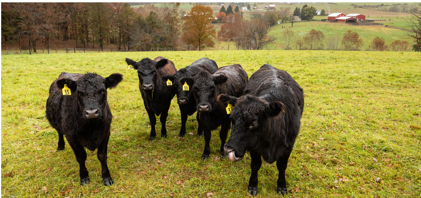
Cattle are grazed rotationally at Pine Draft Farm, seen in Hampshire County, W.Va.