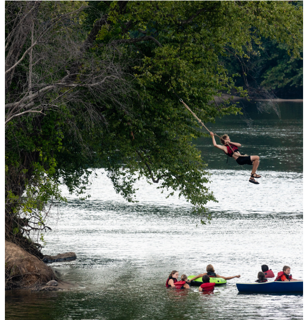
Visitors cool off in the James River amid 90-degree temperatures in Richmond, Va., on Aug. 13, 2019. Between 2010 and 2018, Chesapeake Bay Program partners opened 176 new places to swim, fish, boat, kayak or otherwise enjoy the water. This is a 59% achievement of our goal.

Underwater grasses: In 2018, 91,559 acres of underwater grasses were mapped in the Chesapeake Bay. However, 22% of the Bay was not fully mapped due to prolonged turbidity, weather conditions and security restrictions. Using 2017 levels for these unmapped areas, it is estimated that the Bay may have supported up to 108,960 acres of underwater grasses in 2018. This would be a 4% increase from 2017 figures and a 59% achievement of the partnership's 185,000-acre goal.