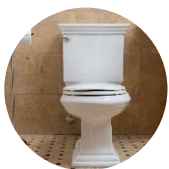
Indoor water conservation measures

Some BMPs are not eligible for credit in CAST. Refer to the CAST Source Data spreadsheet or the BMP Quick Reference Guide for a list of creditable practices & the criteria for credit.