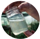
Water quality monitoring