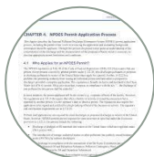
NPDES permit implementation