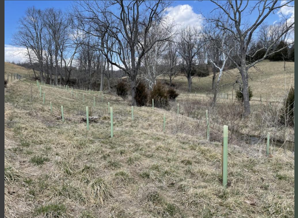
A buffer at Bradford Farm in Virginia