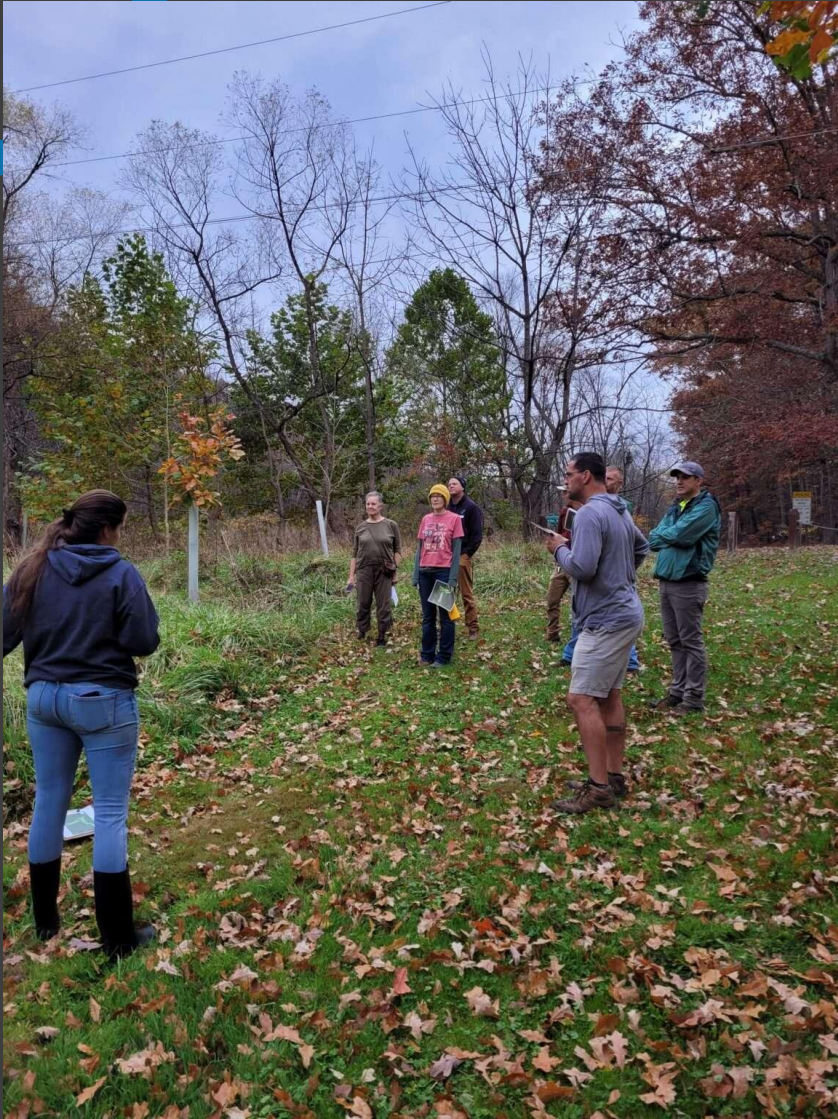
Non-state farm CCLC buffer training.