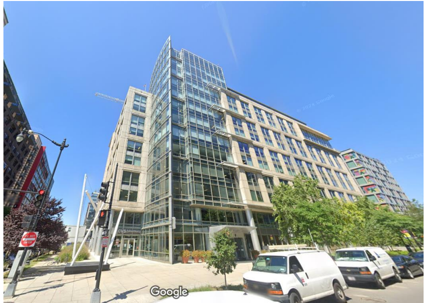
Photo 1. The exterior of the D.C. DOEE building (on 1200 First St).