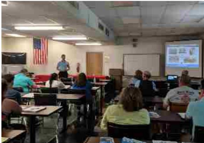
PENNSYLVANIA FLOOD PROOFING WORKSHOP AUGUST 2018