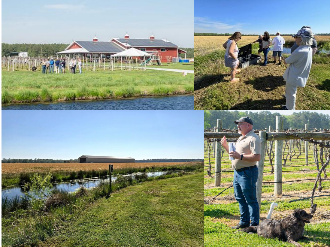
Stop 3: Agro-Tourism and Conservation