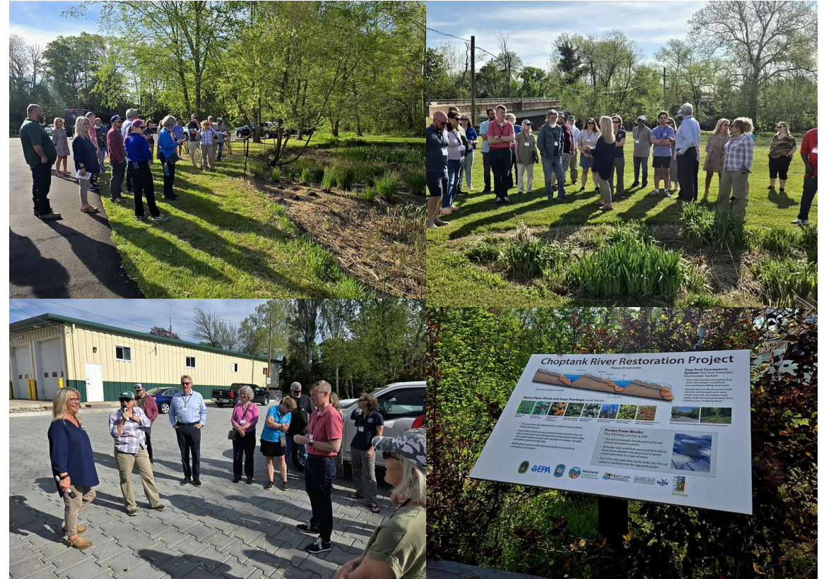
Stop 4: Comprehensive Green Infrastructure Planning