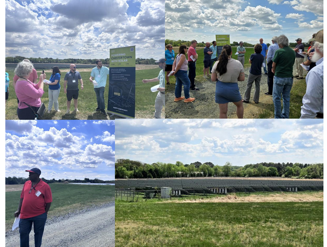
Sustainable Growth and Energy