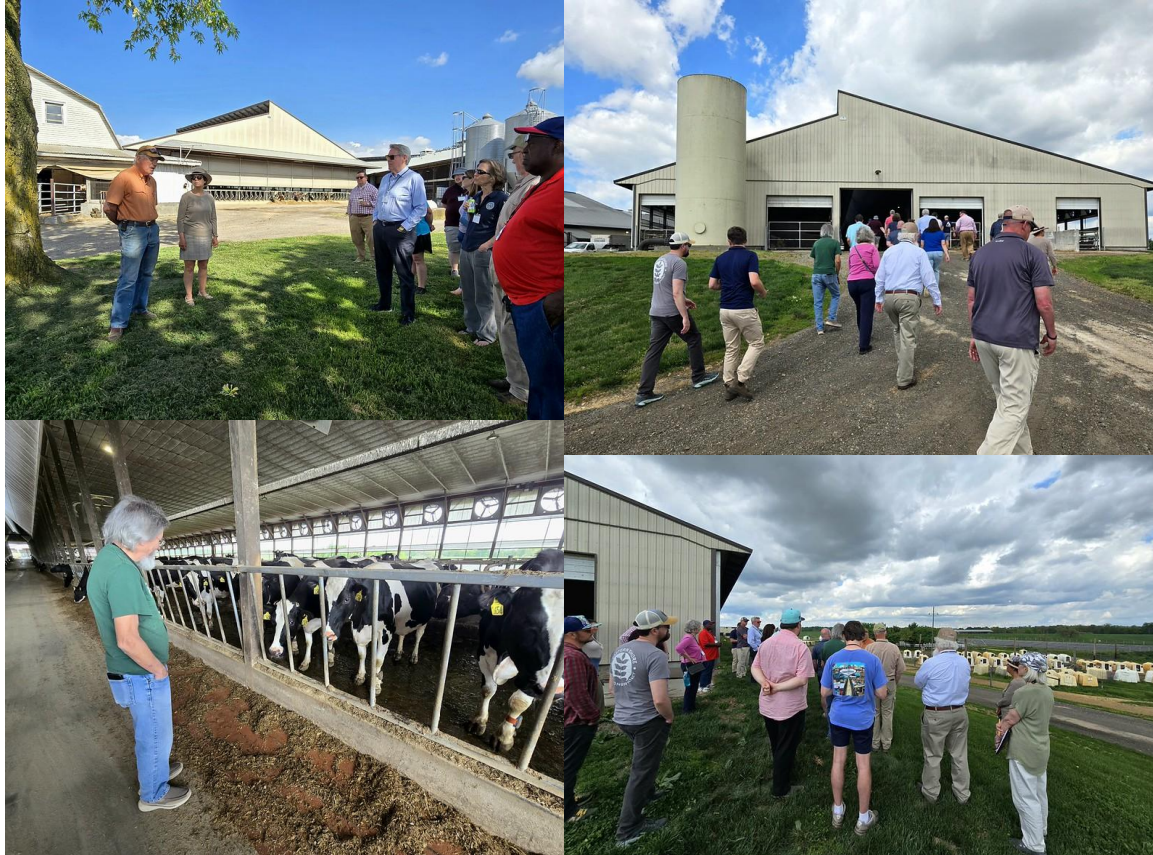
Agricultural Land Preservation