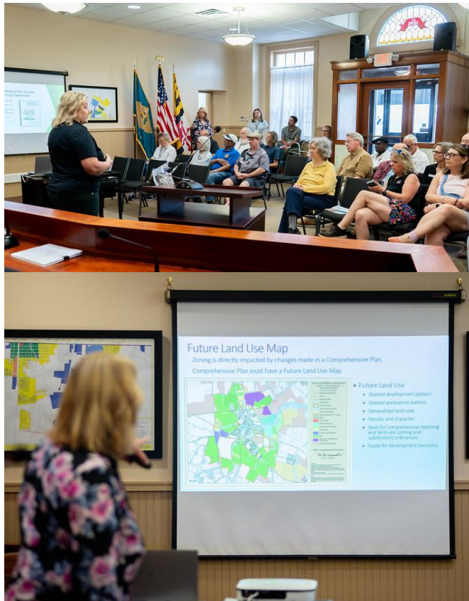
Stop 1: Local Government Planning on Delmarva