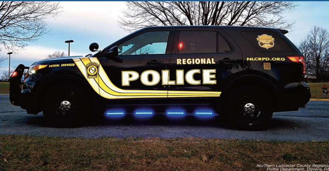
Northern Lancaster County Regional Police Department, Stevens, PA