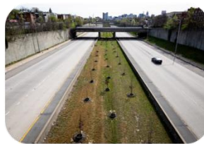
Infrastructure Maintenance and Finance