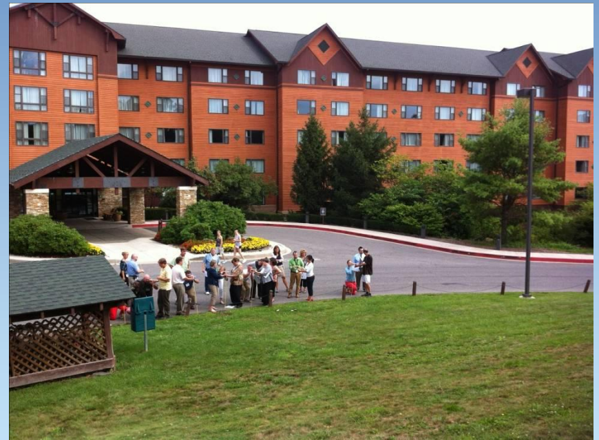
Rocky Gap Resort