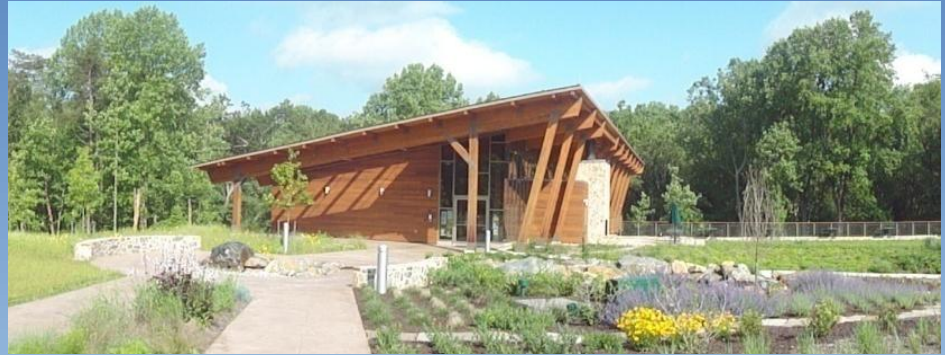
Robinson Nature Center Howard County