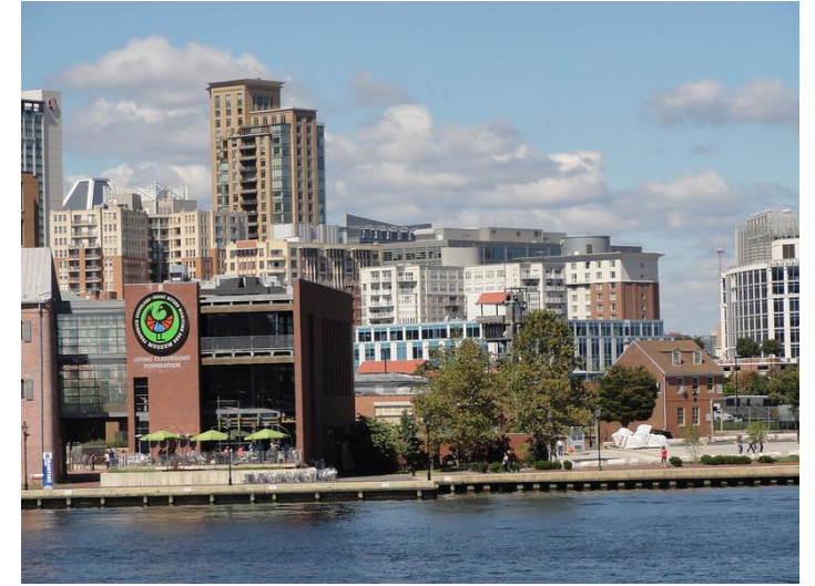
Frederick Douglass-Isaac Myers Maritime Park