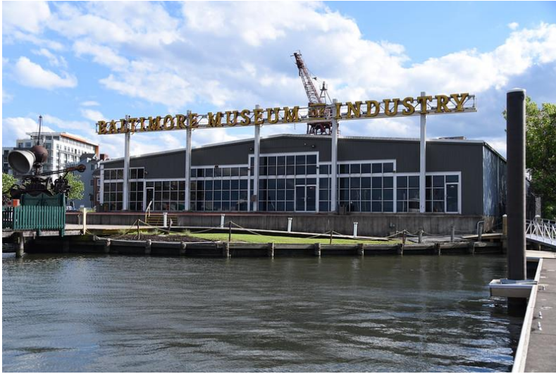
Baltimore Museum of Industry