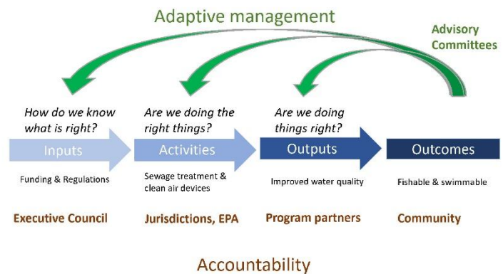
Fig. 3. A potential CBP Logic Model proposed by the STAC Inform Governance and Accountability Ad-Hoc Workgroup to prompt discussion.

In response to the discussion at the Topical Meeting, a potential logic model for the CBP is presented where the inputs lead to activities which in turn generate outputs and ultimately outcomes (Fig. 3). On the adaptive management side, the questions “How do we know what is right?” “Are we doing the right things?” and “Are we doing things right?” relate to the inputs, activities and outputs respectively. The four advisory committees can play a crucial role in answering these questions and provide reasons for celebration or recommendations for improvements. On the accountability side, the CBP Executive Council focuses on funding and regulations, the jurisdictions and US EPA focus on implementation activities, other program partners focus on outputs, and ultimately the community are the judge of the outcomes.