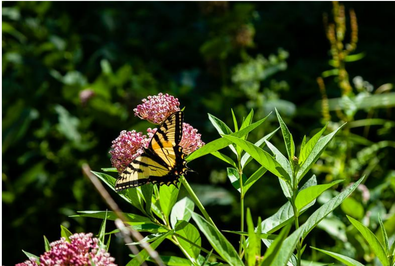
"A tiger swallowtail butterfly visits swamp milkweed growing at Goodyear Lake in Milford, NY"