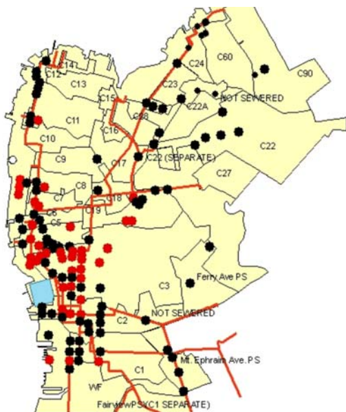
Figure 3a. PCB Sampling Locations in Street Soils for Camden NJ

(Red dot indicates PCB level greater than NJDEP Residential Soil Cleanup Criteria of 0.49 mk/kg using ELISA Method)