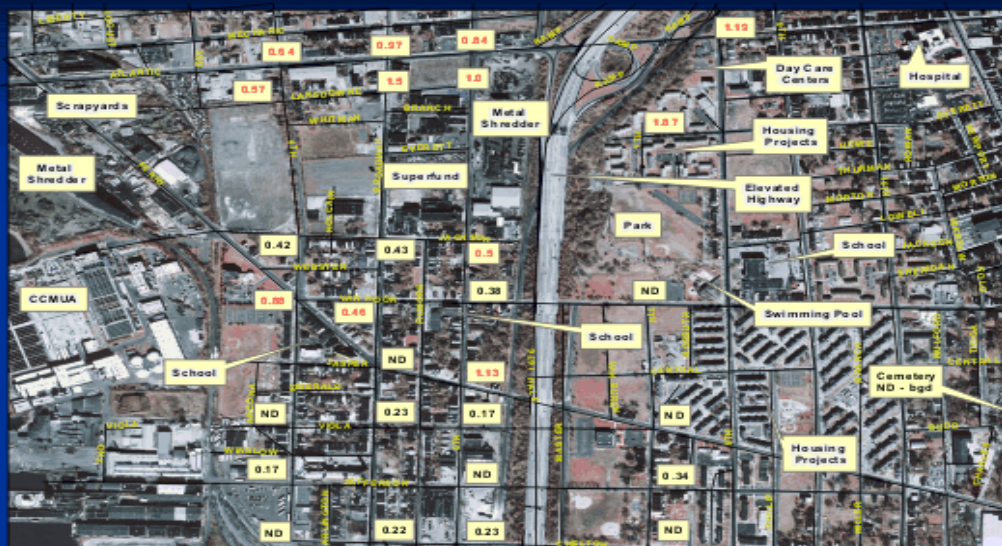
Figure 4. PCBs in Street Soils along Major Truck Routes through Waterfront South, Camden

Many of the facilities identified as potential PCB sources in this trackdown are not regulated by the MUAs directly (i.e., through NJDEP Pretreatment Rules), since they do not have direct industrial piping or connections to the MUA's collection system. Instead, secondary contamination of the combined sewers (i.e., stormwater pipes mixed with sanitary) probably occurs via stormwater runoff over PCB contaminated property, or else fugitive air emissions associated with onsite activities (e.g., shredding metal). For PMP purposes this disparity in sources and regulatory authority does not allow a meaningful way to reduce PCB loadings as part the TMDL process.