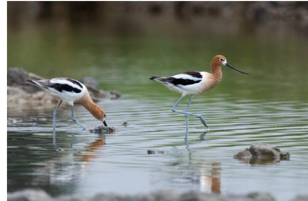
American avocets can be found living in open areas with little vegetation and shallow waters.