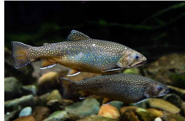
Eastern brook trout swim at the Virginia Living Museum in Newport News, Va., on Dec. 30, 2018.