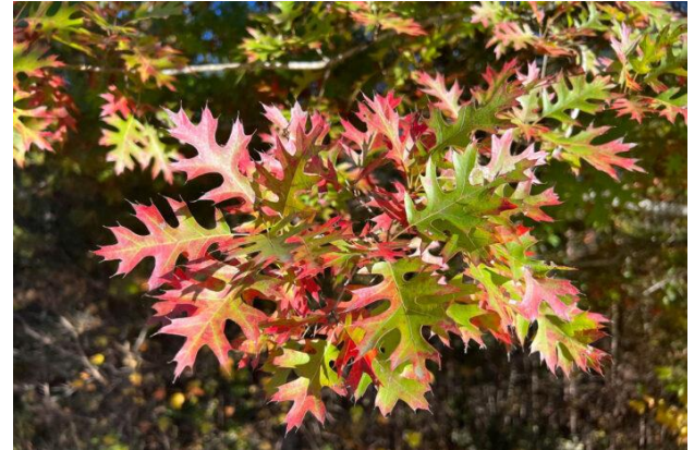
Scarlet oak during fall.

Using the same methodology does not mean no changes were made, as relative effectiveness of basins and current land use assumptions did change based on current science and other updates planned for the model.