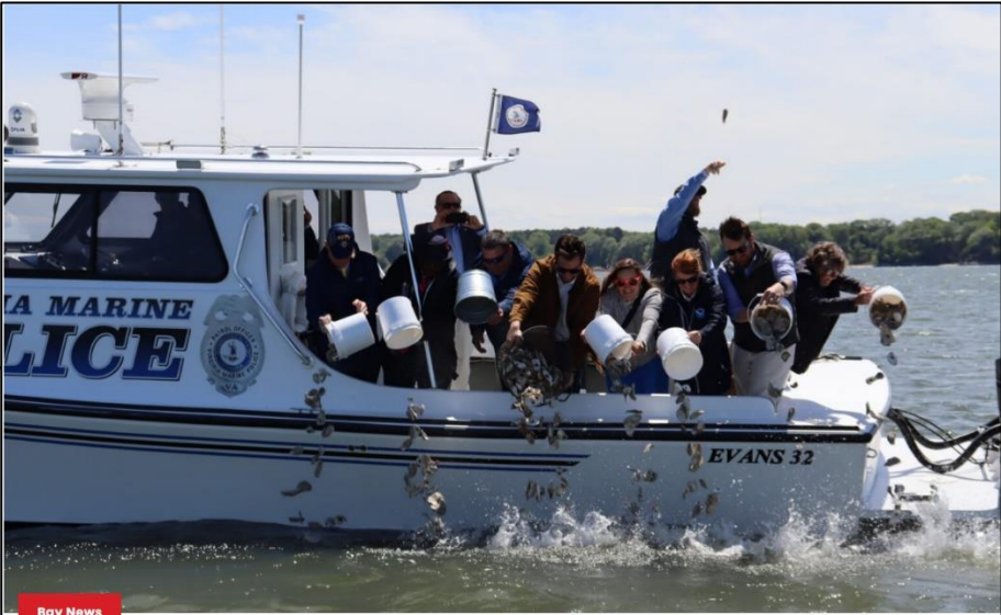
The last oysters of the reef are tossed overboard to settle into their new sanctuary.