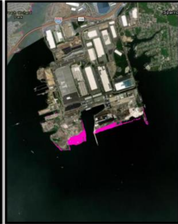
Construction misclassified as Bare Shore in Baltimore County, Maryland