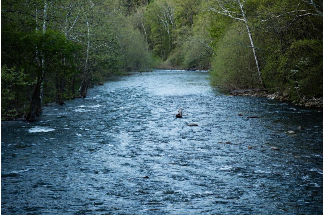
The North Fork South Branch Potomac River flows past Seneca Rocks in Monongahela National Forest in Pendleton County, W.Va., on April 28, 2017.