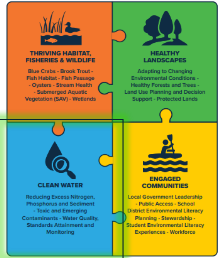
The Four Interconnected Goals of Watershed Restoration