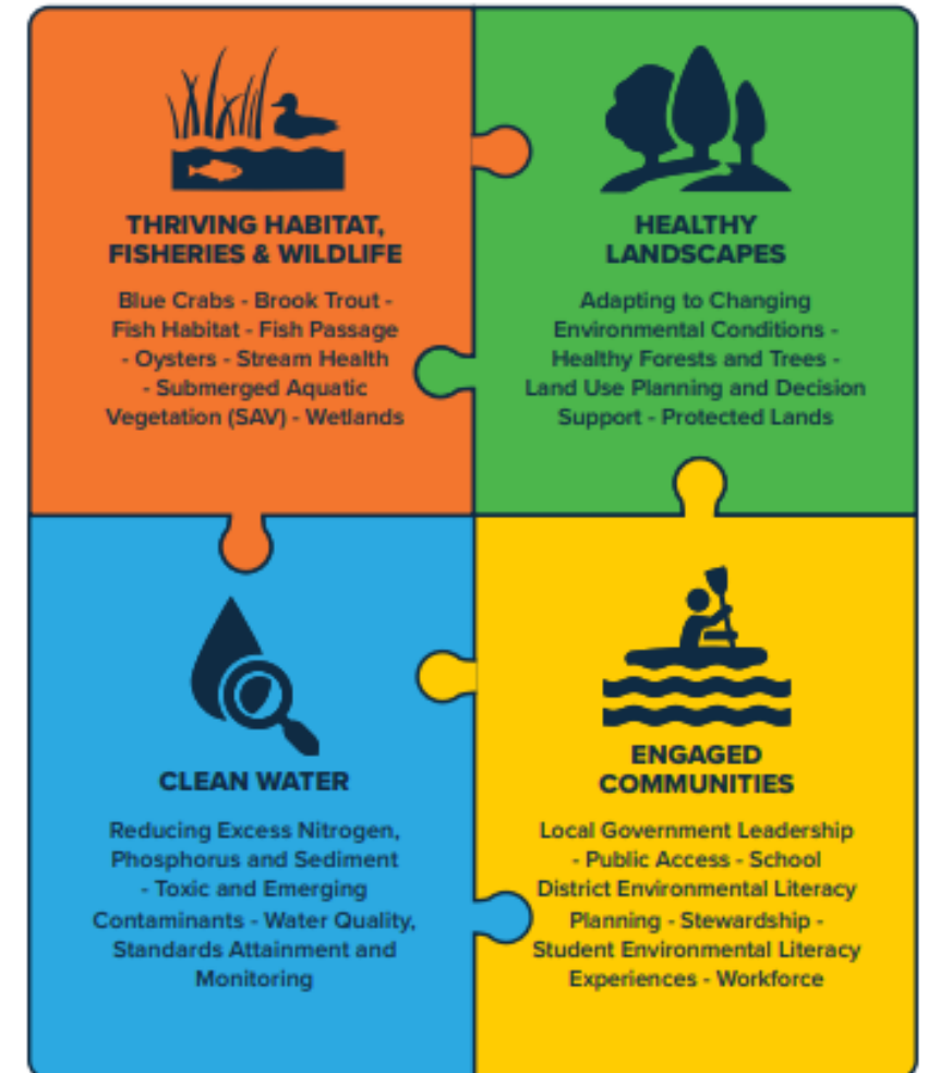
The Four Interconnected Goals of Watershed Restoration