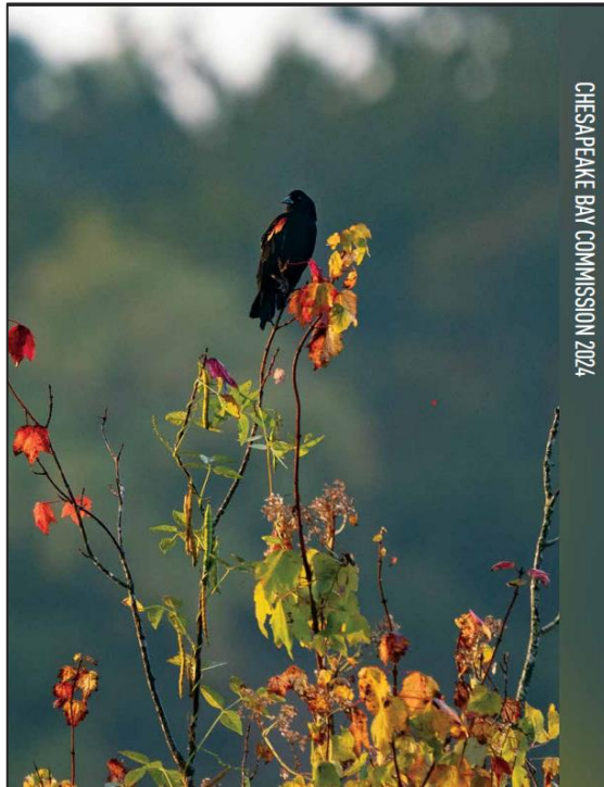
2024 Bay Commission Annual Report February 2025