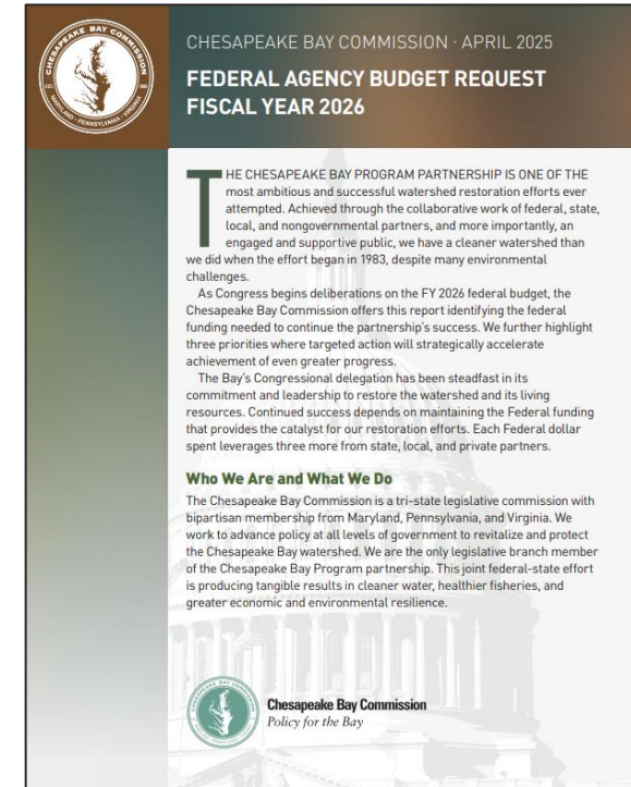
Federal Agency Budget Request FY2026 April 2025