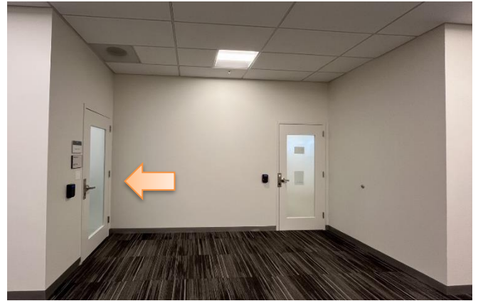
Figure 5: Oyster Room Entrance – Knock on Door on the Left

The building is wheelchair accessible but the door to the office does not have an automatic open/close button. The building is not fragrance free. There is a lactation room in the office. There are semi-private huddle rooms. Conference rooms are brightly lit. During the meeting there will be open captions available. Please contact awelch@chesapeakebay.net with any additional accessibility requests or questions. Requests made sooner than one week before the meeting may not be met.