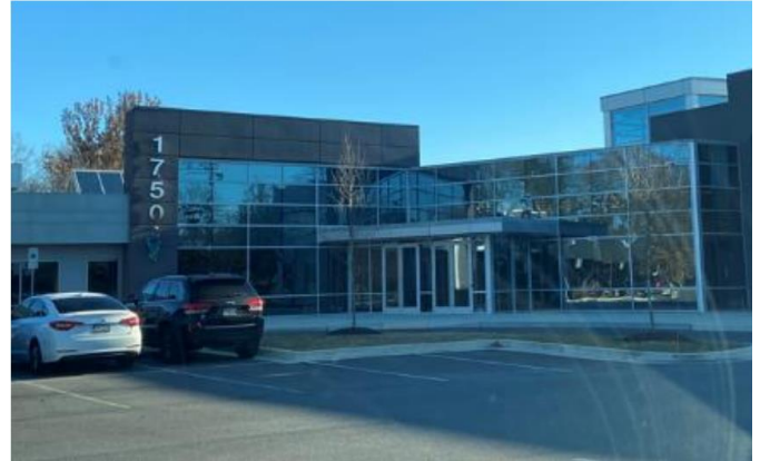
Figure 1: Front of Building

Contact: Allison Welch awelch@chesapeakebay.net (Office Phone) 410-267-5721