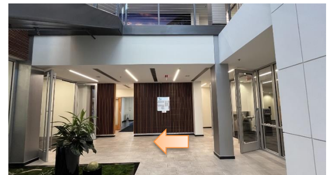
Figure 3: End of Main Building Hallway – Turn Left