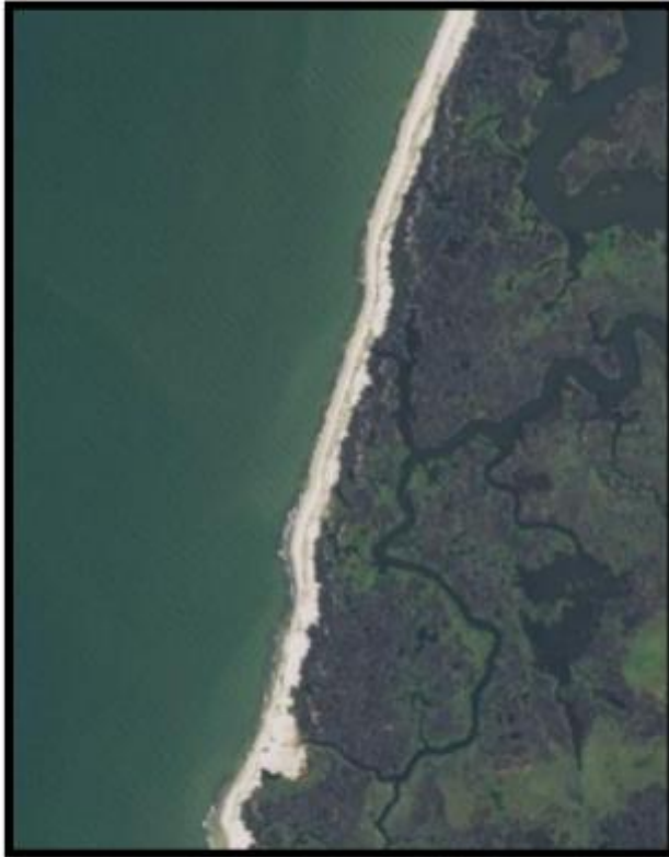
Beach along Janes Island State Park