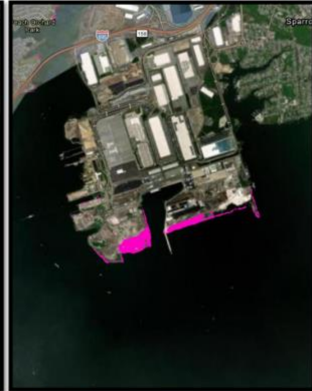
Construction misclassified as Bare Shore in Baltimore County, Maryland