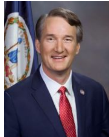
Glenn Youngkin Governor Commonwealth of Virginia