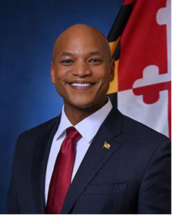
Wes Moore Governor State of Maryland