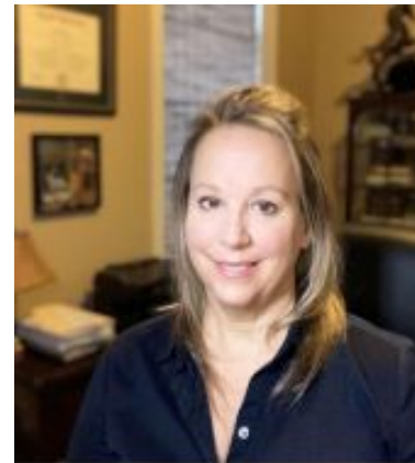
Carol Lamb-LaFay Acting Deputy Commissioner for Water Resources State of New York