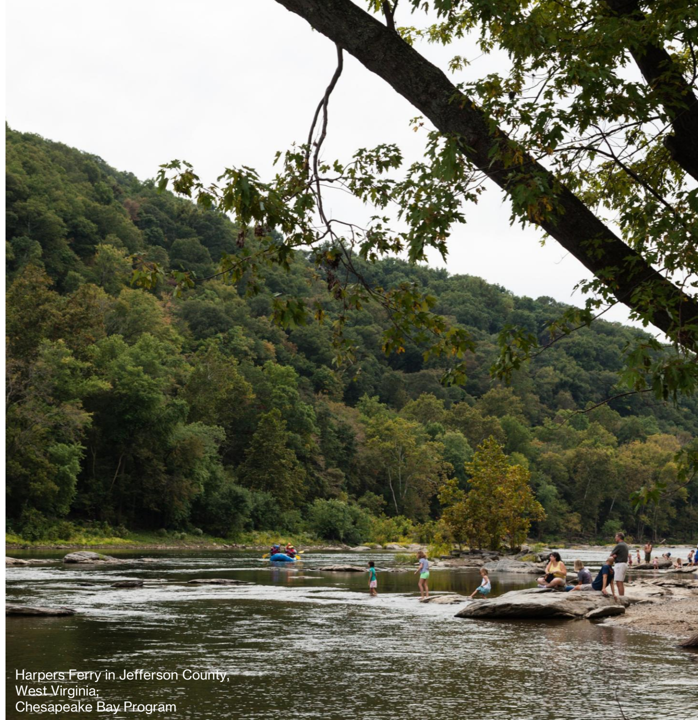
Harpers Ferry in Jefferson County, West Virginia, Chesapeake Bay Program