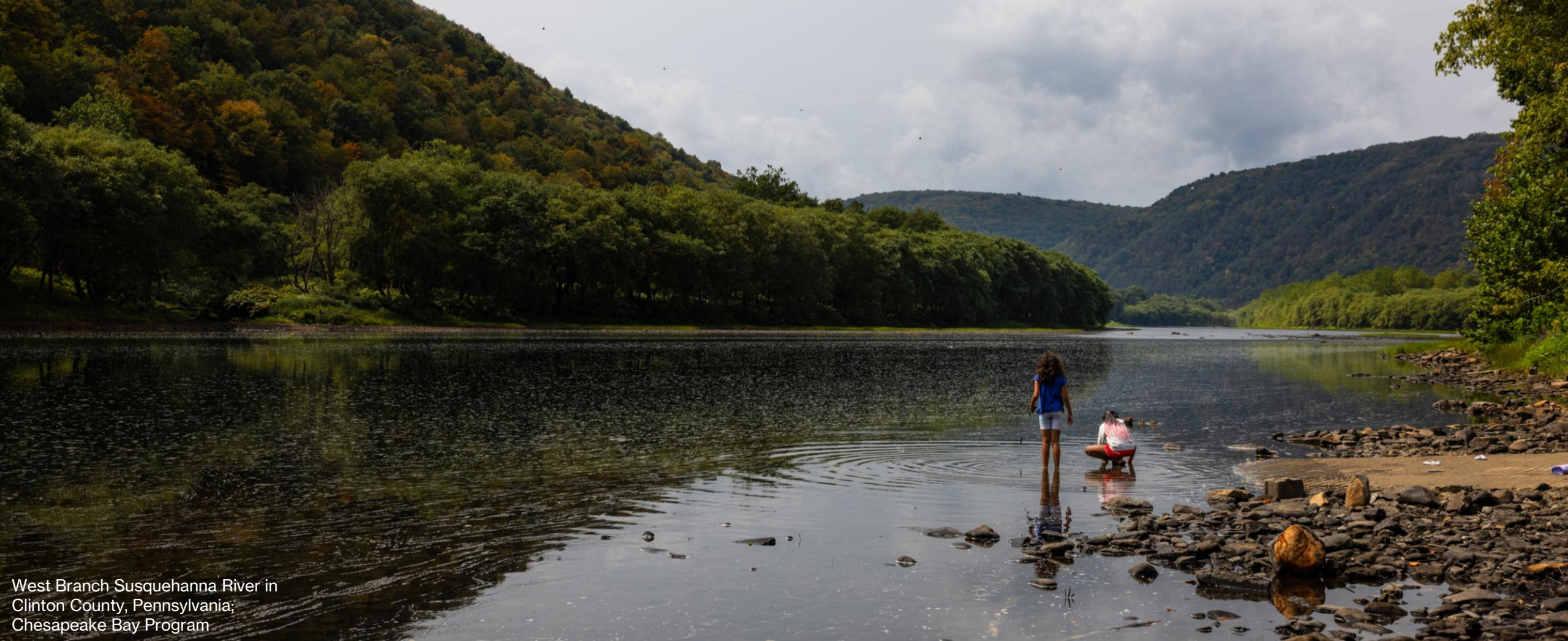
West Branch Susquehanna River in Clinton County, Pennsylvania