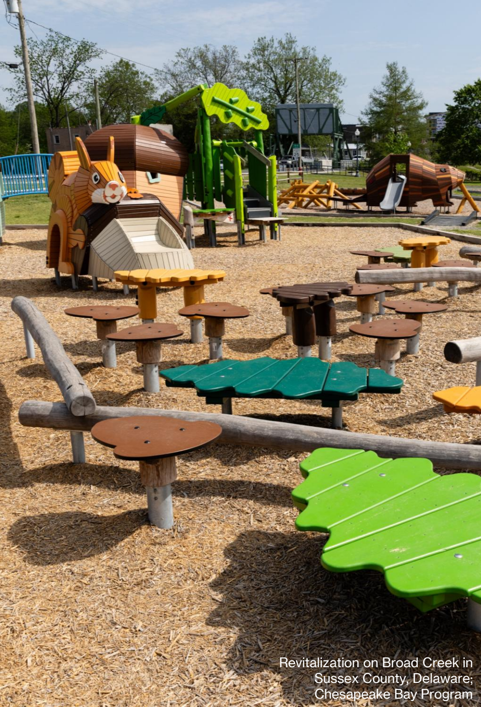
Revitalization on Broad Creek in Sussex County, Delaware