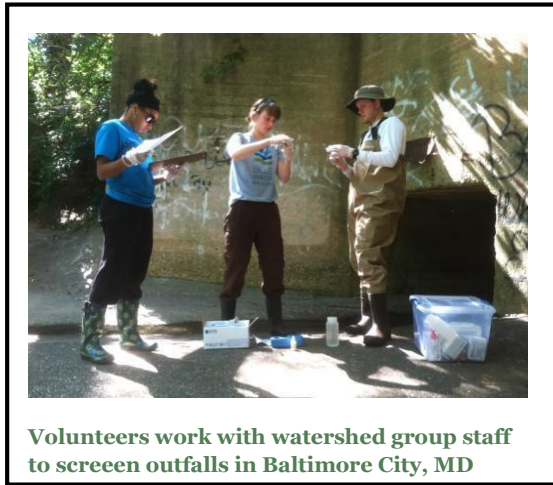
Volunteers work with watershed group staff to screen outfalls in Baltimore City, MD

Partner with local watershed groups! It's a great way to engage the public and outsource some of the requirements associated with an advanced program. Volunteers can be the eyes and ears of the local government when it comes to illicit discharges. They can contribute by walking the stream with staff, learning what to look for, helping to locate stormwater outfalls (of all sizes), and collecting water quality samples. Some municipalities may opt to partner with watershed groups and other non-profits to outsource their sampling requirements as long as volunteers are trained in the appropriate methods of water quality monitoring.