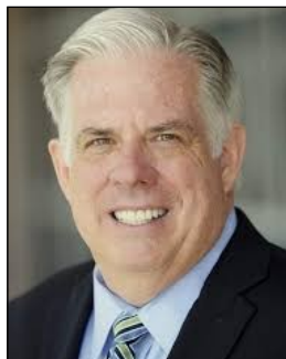
Larry Hogan, Governor Executive Council Chair