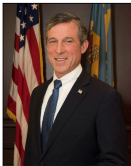
John Carney, Governor