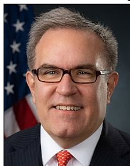
Andrew Wheeler, Acting Administrator