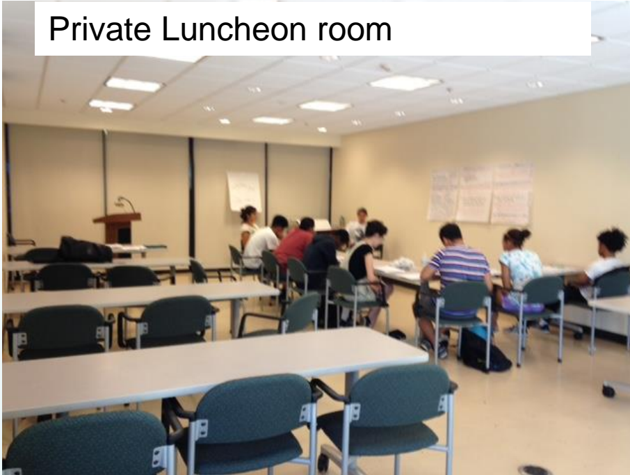
Private Luncheon room