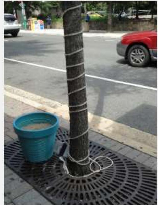
City trees lead a hard life struggling with tree grates, stranglers by light wires, and collecting cigarette butts