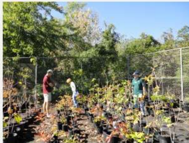
TreeStewards will be at the nursery to provide education.

Choose the best native tree for your Arlington yard with the help of TreeStewards this fall. Arlington County's Natural Resources Division is providing a variety of native tree species and one would be perfect for your yard. Among the different species offered this year are Eastern redbud, Blackhaw viburnum, Staghorn Sumack, American Hophornbeam, Hackberry, and American Sycamore. The trees being distributed are generally termed "whips" in the nursery trade and are in two-gallon containers – you can carry them and they will fit in