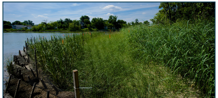
An urban tidal wetland project in Norfolk, Virginia uses coconut fiber logs to control erosion.

Safety and Floodplains: Floodplains, which include wetlands, are vital for mitigating the impacts of coastal storms and flooding. Communities participating in the Community Rating System program can reduce the cost of flood insurance premiums by preserving green spaces including floodplains, living shorelines and wetlands.