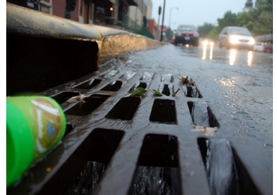
Polluted runoff enters storm drain

American Rivers, the Conservation Law Foundation, and Natural Resources Defense Council, along with their co-petitioners from each of three EPA regions, targeted the petitions to regions that are home to some of the nation's most iconic and threatened waters. Additionally, these regions are well poised to become leaders for the rest of the country.