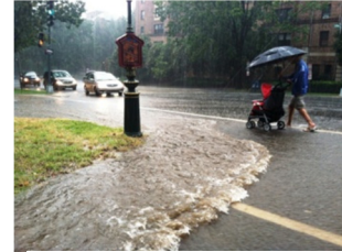
Polluted runoff in Washington, DC.

Clean water is essential to the health and safety of our homes and families, yet polluted runoff has quickly become the one of the biggest sources of water pollution in the country.